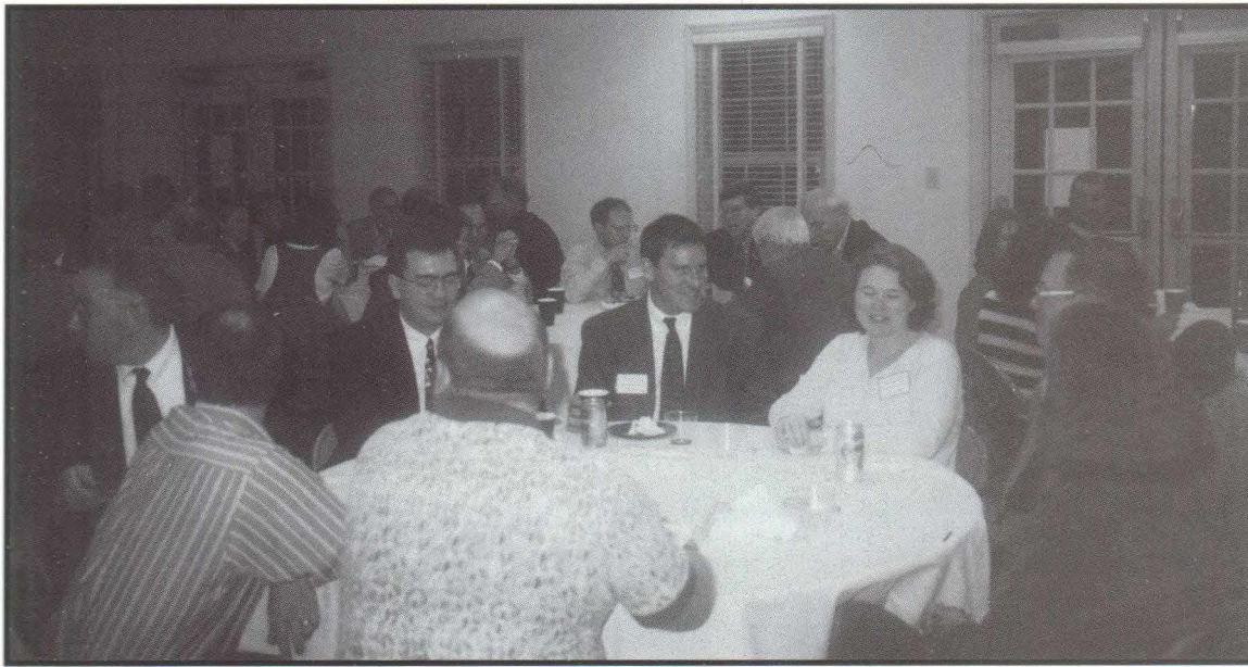
Nationalism around the world, topic of discussion during one of The Historical Society sessions held at Burritt on the Mountain.