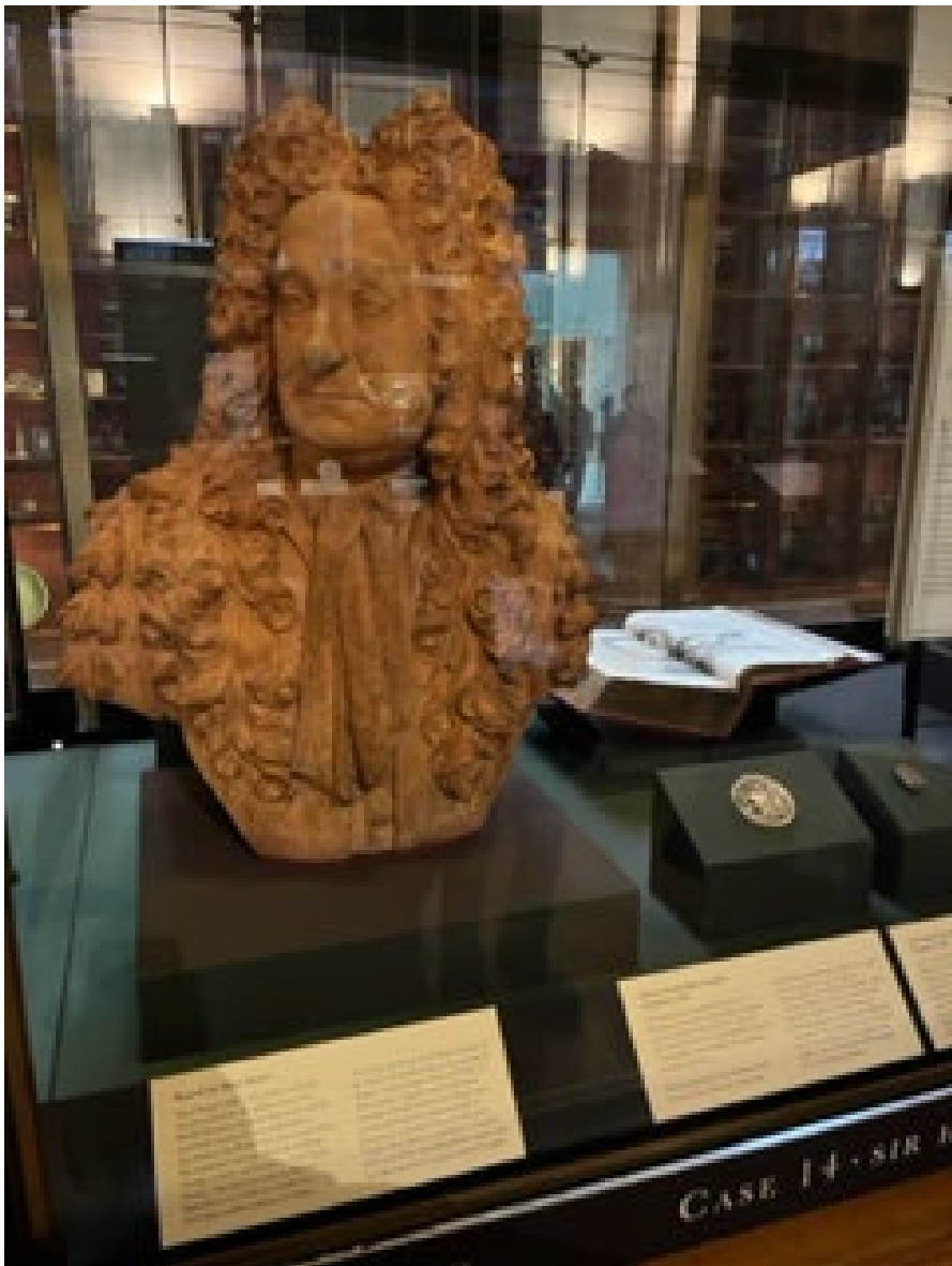
Sir Hans Sloane, Rysbrack, 1756, Terracotta Bust, British Museum, London, United Kingdom

Urban legend in the United Kingdom attributed Sir Hans Sloane (Hans Sloane, 1660-1753) with the invention of chocolate milk. Evidence suggests that he did not invent the drink, but he may have helped to globalize it.