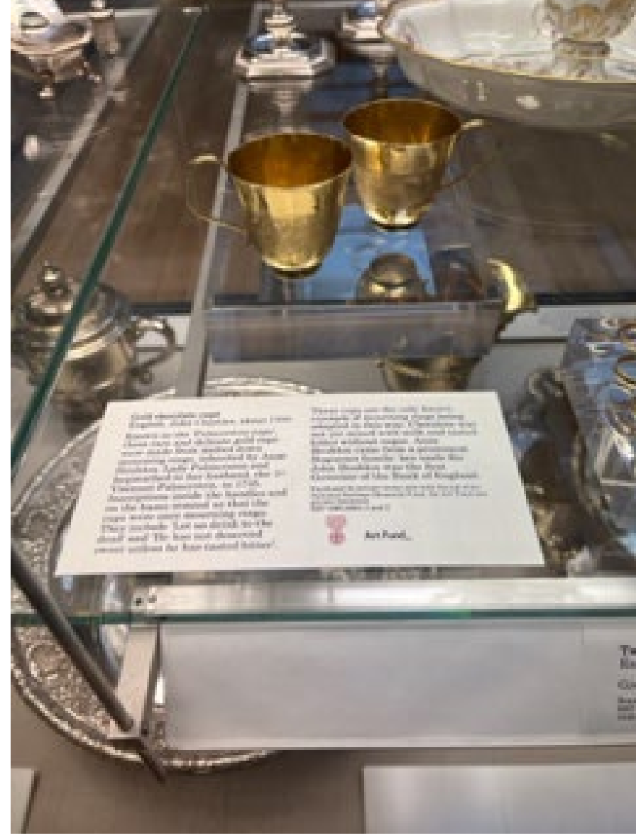
Palmerston Gold Chocolate, Cartier, 1700, Cups, British Museum, London, United Kingdom