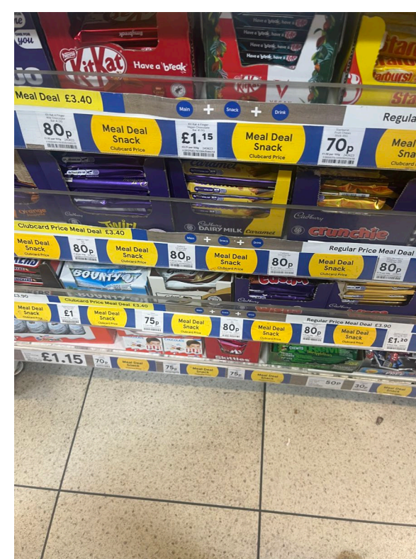
Cadbury Chocolate For Sale, Tesco Express, March 2024