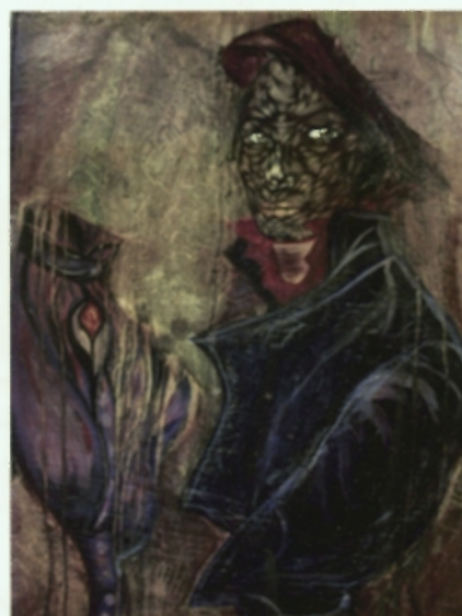
mixed media drawing by Toyin Odutola