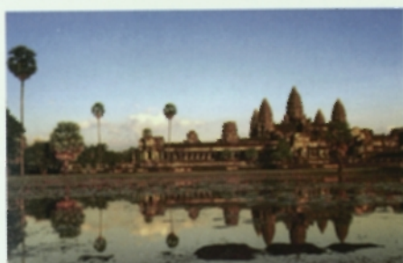
Angkor Wat, Cambodia at Sunset