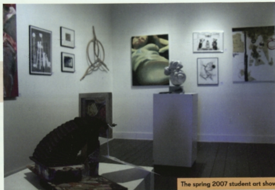
The spring 2007 student art show

Scholarships are available for art and art history students at UAH. These are just some of the many scholarships offered. High school students can submit portfolios through the Alabama State Council on the Arts or win scholarships through a jury award at UAH's annual Academic Tournament Day. The Jeffery Bayer Memorial Scholarship is a scholarship awarded to students through participation in the Annual Student Art Show. Students with a strong academic record are eligible for consideration for the Lella C. and Frank H. Bromberg Jr. Endowed Scholarship. Students interested in study abroad may apply for the Ina Clark Global Studies Scholarship. The Bill Dale Scholarship may be given to art majors or minors who also play in the UAH Wind Ensemble. The Shelby J. King award is a need- and academically-based scholarship for students