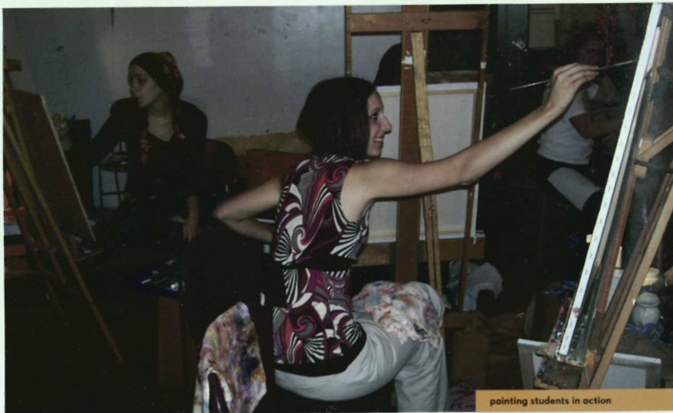
painting students in action