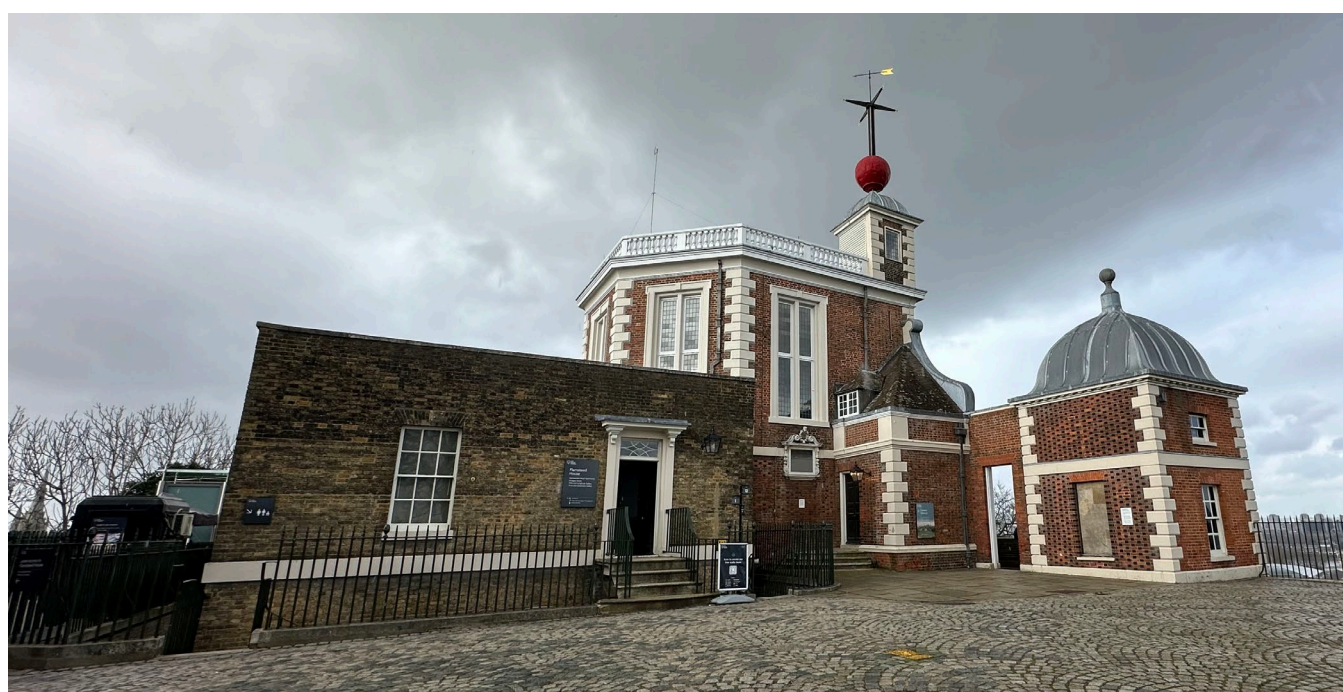
The Royal Observatory at Greenwich, or the Flamsteed House, built in 1676