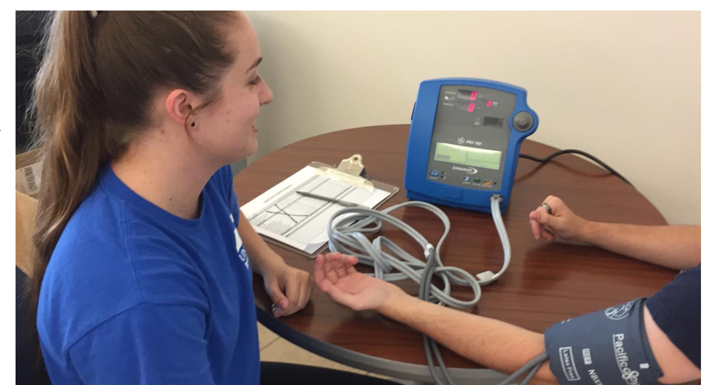
Figure 2: Primary investigator with subject