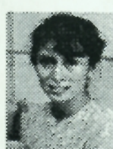
Aung San Suu Kyi