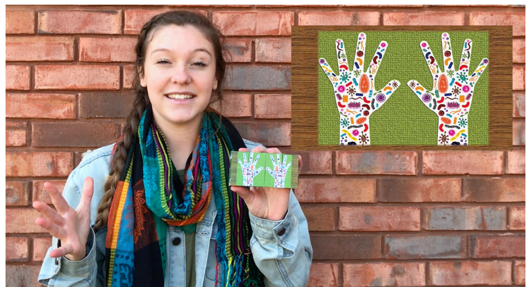
Hand Hygiene Tutorial Video

Nurses play a key role in encouraging behavior change and best hand hygiene practices among clients and within communities.