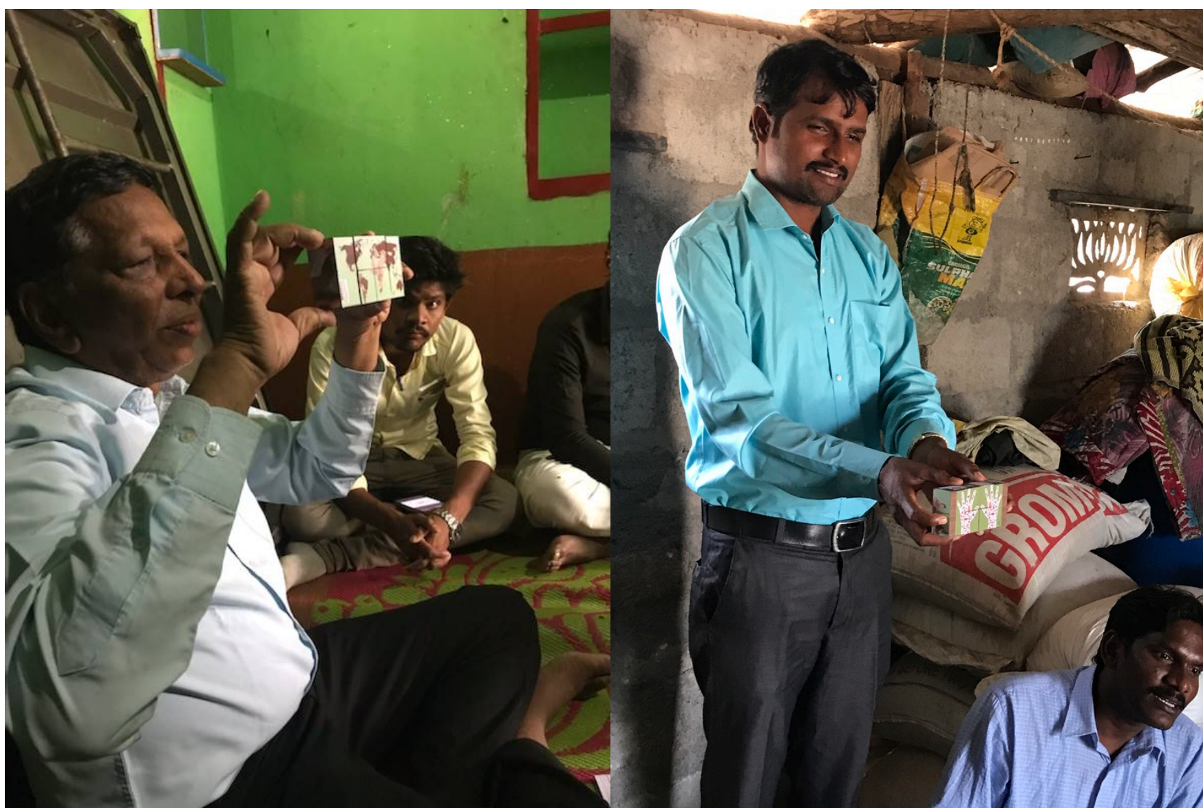
Presenting the Hand Hygiene Cube in Rural India