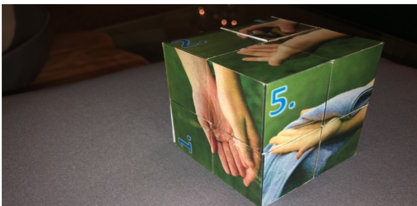
Hand Hygiene Cube

When analyzing the needs of rural India, there are significant barrier in the education of the importance of hand hygiene practices in rural India. The intervention implemented was a hand hygiene informational cube to educate on the importance of adequate hand washing and effective mechanisms.