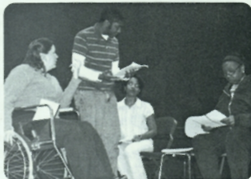
Four Spirits cast members rehearse a scene.

"For me," Naslund said, "one of the most interesting features of transforming the novel into a play was that in the play we especially focus not on Stella Silver (who represented me in the novel) but on Cat Cartwright, a young white woman activist in a wheelchair, and on Christine