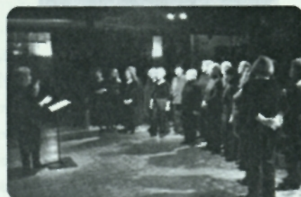
The Huntsville Feminist Chorus at their 2010 Winter Solstice Concert.

The UAHuntsville Women's Studies Program will publicize details in the online newsletter and through e-mail. The concert will be free and open to the public. More information at (256) 824-6190.