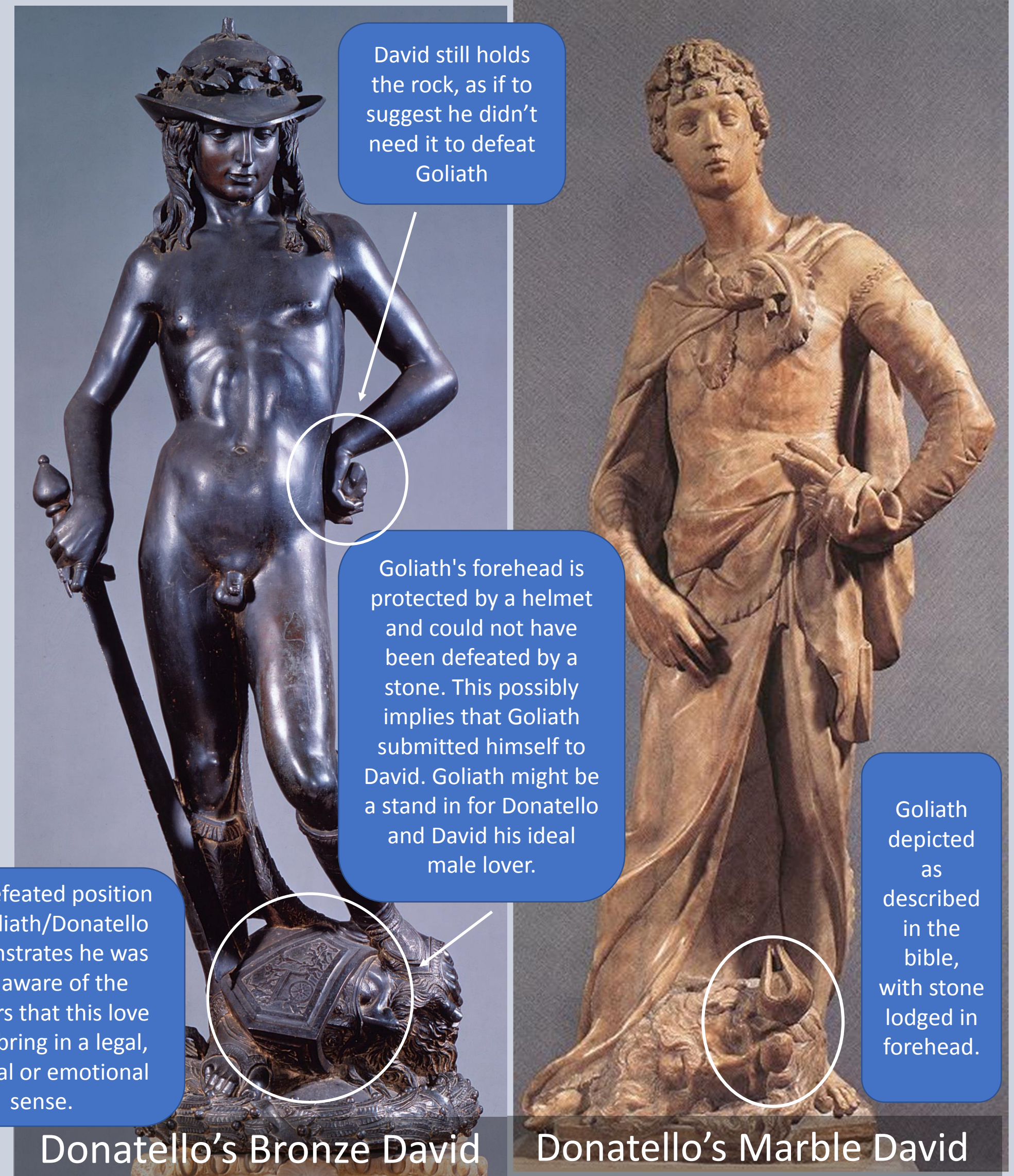
Donatello's Bronze David