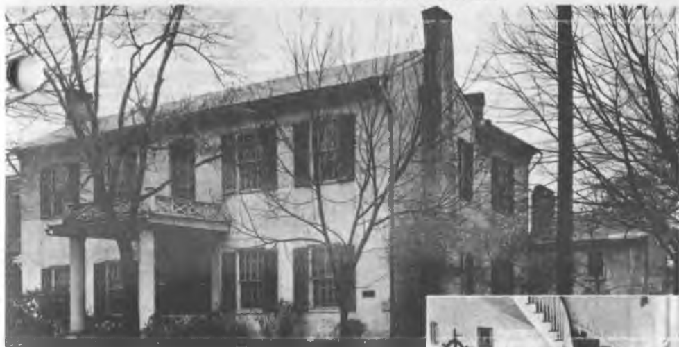
A fabulous collection of treasured heirlooms—vast array of rare and beautiful antiques. Not one piece available before!

HUNTSVILLE, ALA. 301 Gates Street at Green Street, only two blocks of Court Square, one block south of Episcopal Church, one block southwest of First Presbyterian Church, 92 miles north of Birmingham. Home of Redstone Arsenal in the TVA area.