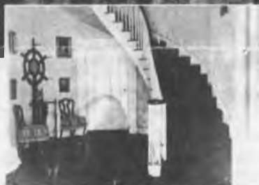
Photo shows entrance hall with its architecturally perfect circular staircase that winds unsupported to the second floor.