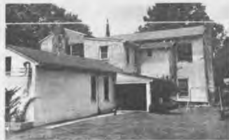
Photo above shows rear view of the Weeden Home, nestled beneath a canopy of splendid and ancient trees. Plenty of breathing space here.

Agriculturally and industrially, Huntsville is booming, and the future looks bright indeed. Here, at Brdatone Arsenal which sprawls over 40,000 acres, over 3,000 physicists, chemists and electronics engineers have moved in to help develop America's rockets and guided missiles program. Attracted by cheap TVA power, over a dozen new industries, making everything from stockings to stoves, help keep payrolls skyrocketing. Few cities anywhere are growing faster. Advance and progress are apparent in every direction. This is why this property, located only 2 blocks of the city square, is so highly desirable. Its worth in a few years is incalculable. Now, make it yours where you set the price!