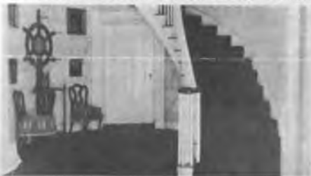
The South's prize suspension stairway—unsupported in any way and acclaimed by architects for its architectural perfection. Car-pets for floor and stairways cost $1,000. Mahogany hat and umbrella stand with beautiful concentric design at top goes.

A sensitive slave put his heart and soul into the creation of this bed that retains its original splendor. Hand carved for Governor Patton's bride, Marble top tables, Mahogany chest, dresser, wash stand and assorted chairs in Blue Room with the bed upstairs.