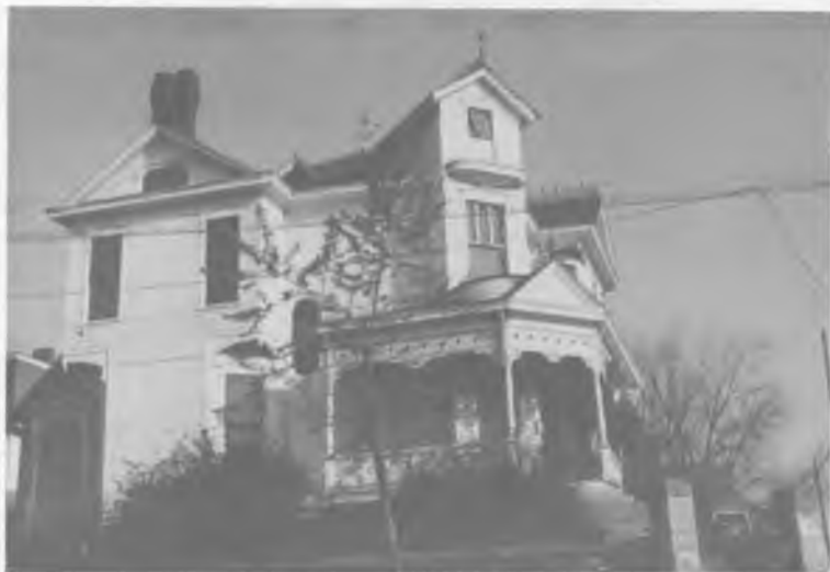
Fountain Row (formerly named Oak Street). The Hutchens Home was near the present Public Library. 1963 photograph.

325 Franklin Street - northeast corner of Franklin and Gates. The George R. Holmes Home. The Huntsville Clinic was located in this house prior to its demolition. A brick office building is presently on this site.