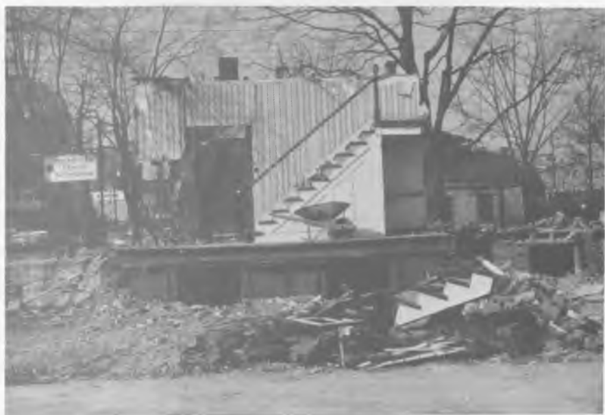
Randolph Street. The Laxon Home. "The Death of a House" is the name of a watercolor painted by Louise Marsh from this photograph taken in 1966. The steeple of the First Methodist Church is visible in the center background.