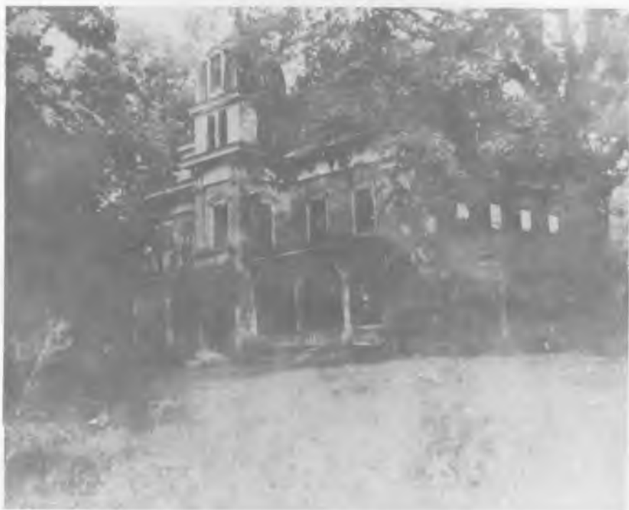
604 Randolph Avenue. The Donegan-Campbell House was torn down c. 1926. Huntsville High School was built there in 1927, later becoming Huntsville Junior High and presently the Annie Mertz Center.