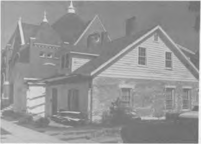
203 Lincoln Street. The O'Neal-Miller House. Owned by the Central Presbyterian Church, this house was demolished in 1982 to provide open space for future church needs.