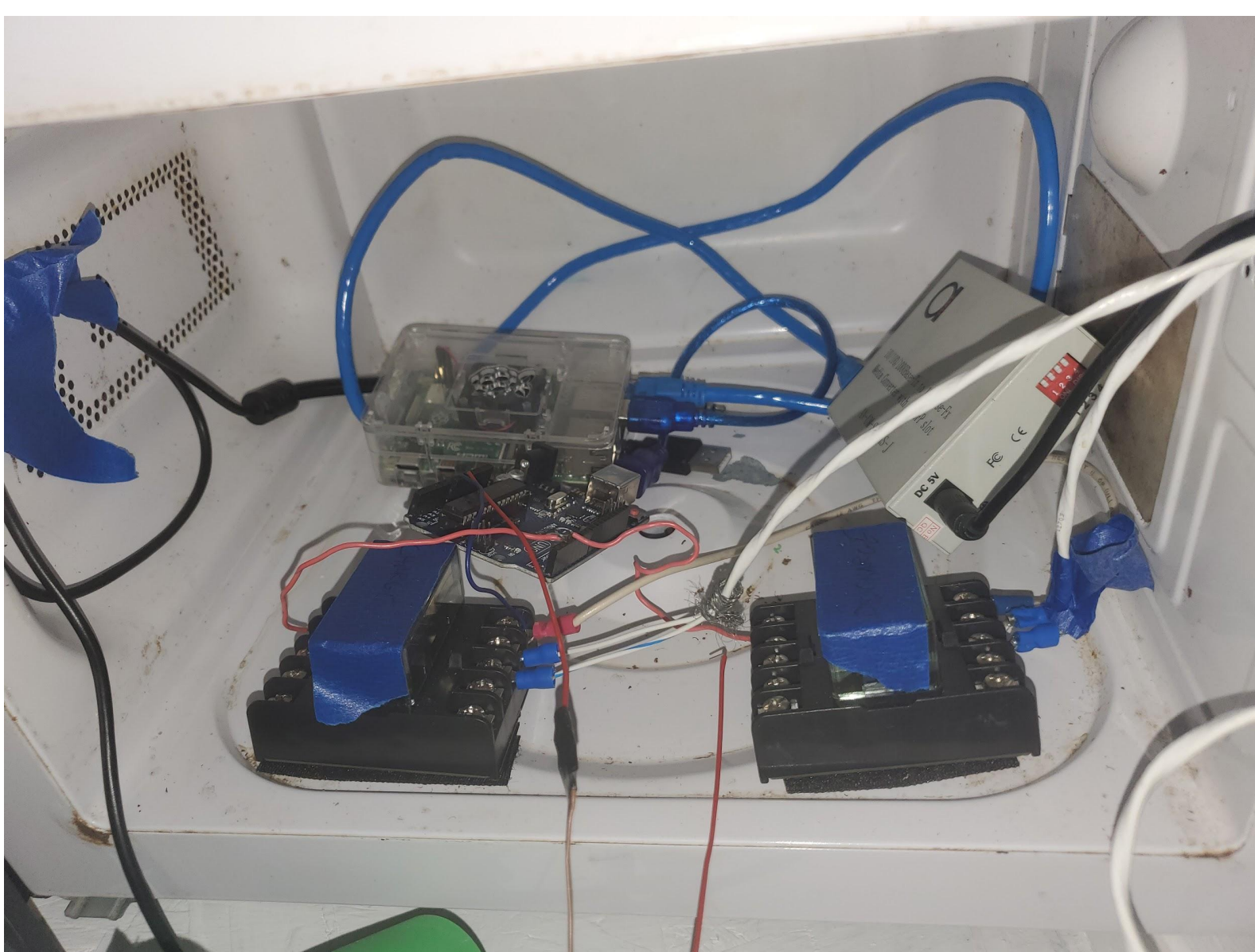
Figure 1. Hardware for control system. Kept inside a microwave to shield from Electromagnetic Interference (EMI).