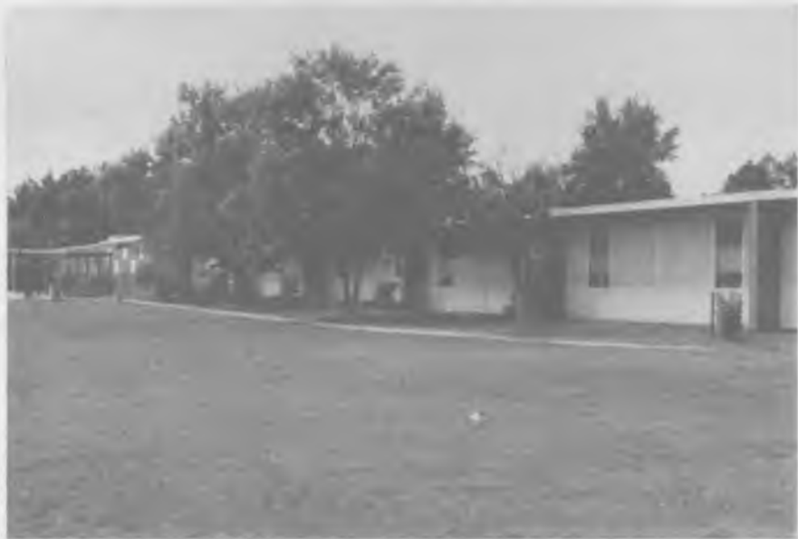
Blossomwood Elementary, built in 1956, was one of Huntsville's first school buildings influenced by the International Style.

the average rate of "one classroom per week" to meet the huge influx of students. This large number of new schools, up until 1966, shared a number of characteristics. They were nearly all one-story, and as a consequence, rambled over their sites in a loose arrangement of low, flat-roofed wings. Many used curtain walls and all had a full wall of windows at one side of each classroom. Many had skylights in the classrooms and other spaces. An awkward hybrid word - "cafetoriums" - was devised by some planner to describe the combination cafeteria-auditoriums used in the smaller schools. These "cafetoriums" usually were considerably taller than the rest of the building and sometimes had irregular-profile roofs, as well, to give a visual accent to the sprawling building.