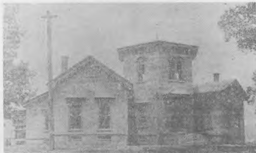
An early Dallas Mill Grammar School (predating the Rison School and approximately on the same site) was housed in the old Moore home. This newspaper photograph was copied from The Huntsville Mercury , Century Edition, July 23, 1916.