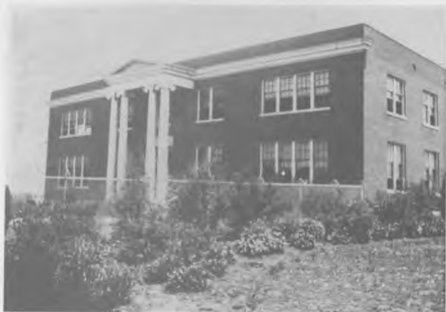
This photograph of Joe Bradley School on Triana Boulevard was taken before additions were made to the building in 1925.