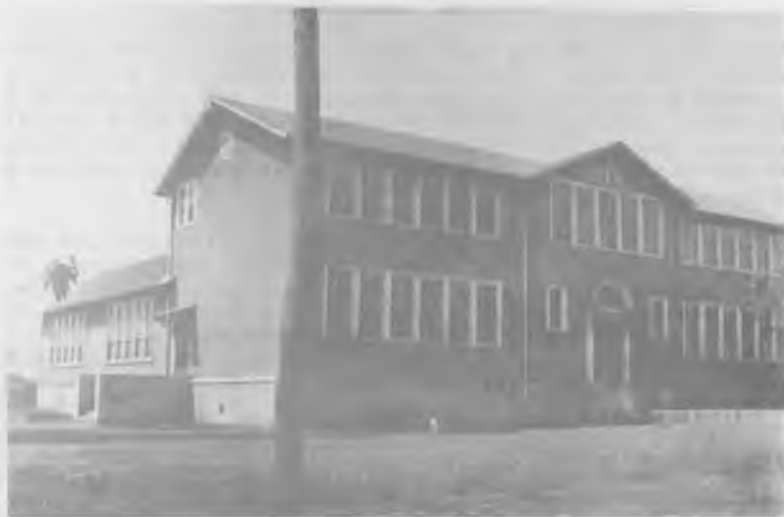
The old West Huntsville School on Ninth Avenue has been replaced by a modern brick school building on the same site.