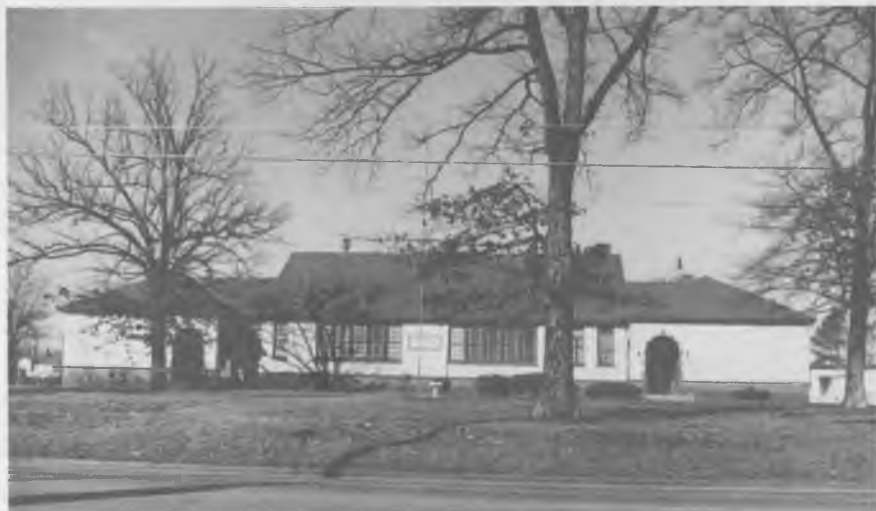
Rison School was built by Dallas Mills as a mill village school in 1920 at 509 Oakwood Avenue. The building is scheduled for demolition, being in the right-of-way for the I-65 highway.