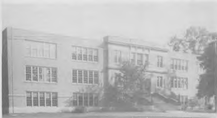
The 1927 high school at the corner of Randolph Avenue and White Street. It will soon be renovated to serve as administrative offices for the city schools.