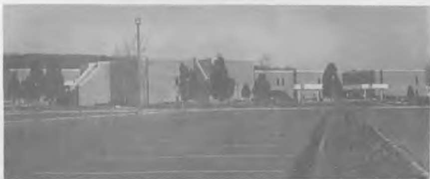
The 1972 J. O. Johnson High School design utilizes both the "pod" and individual classrooms in its arrangement.