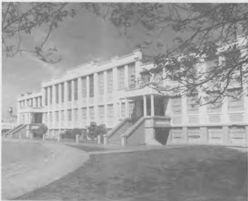
Lincoln School, still in use as an elementary school, was built by Lincoln Mills in 1929 at 1110 Meridian Street.

Maintenance Department) "it could probably be rolled end-over-end without hurting it much." Lincoln School's stylistic category could be termed "stripped Renaissance Classical." It has the pilasters, stepped parapets, high central block flanked by lower wings, Tuscan colonettes, and cove-corner spandrels that can be seen in more elaborate buildings of Renaissance Revival design.