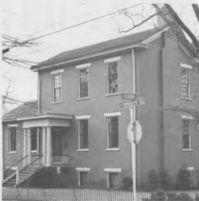
Steele House, 519 Randolph

Steele's own home at 519 Randolph fitted this description before later alterations were made. Greek Revival details were added to the house after it was completed; these