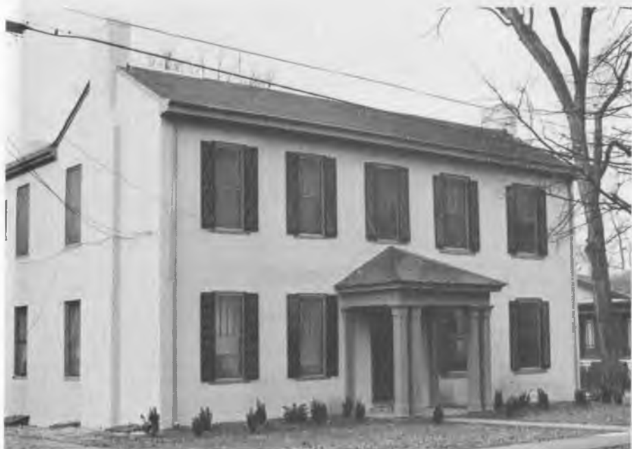
Figures House, 423 Randolph

The exterior displays the traditional five-bay facade with central entrance, gable roof with box cornice, and gable end