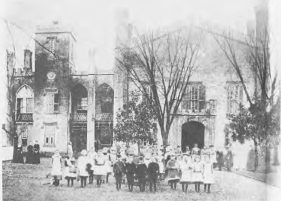
Huntsville Female Seminary, Demolished