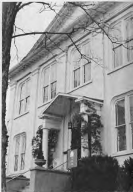
Cox House, 311 Lincoln

At a still later date, an owner desired to update the house to the Italianate style. During this remodeling which probably occurred shortly after the Civil War, the windows were rounded at the corners and the double Italianate front doors were installed. The last alter-