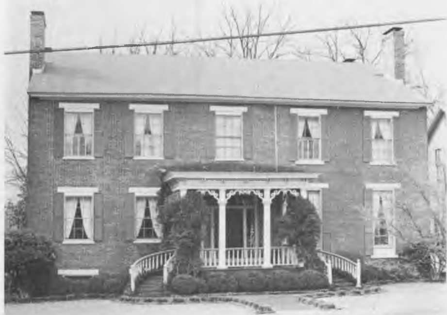
Yeatman House, 528 Adams

The Yeatman House is an excellent example of the three-bay house that was enlarged to five. The original section