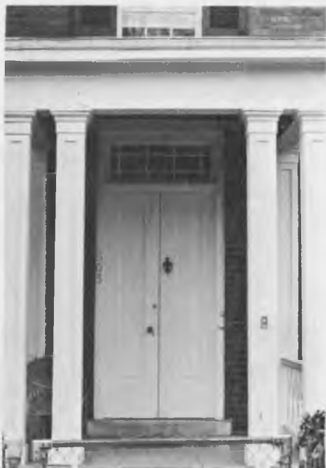
Cabaniss House, 603 Randolph

The main body of the Cabaniss House is the traditional three-bay Federal design, but the porch has square paneled columns, the door is double with each leaf having a single full length panel, and the top-light is rectangular rather than fan-shaped, all distinctly Greek Revival treatments.