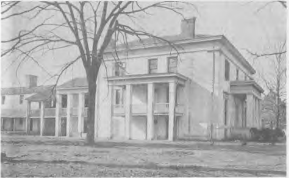
Oak Place, 808 Maysville

The architectural detailing inside is equally restrained and bold; moldings are massive, and mantles are heavy and simple, composed of wood pilasters carrying entablatures.