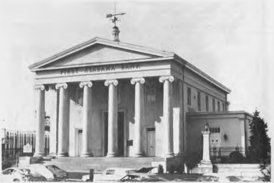
FIRST ALABAMA BANK