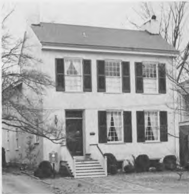
Feeney House 414 Randolph

with the wall along the end gables and neatly boxed along the front where it has a moderate extension beyond the wall. This was built as a two-room house, one up and one down connected by a stairway which has the round, curving railing, rectangular balusters, and decorative stair brackets that are traditional with the Federal style.