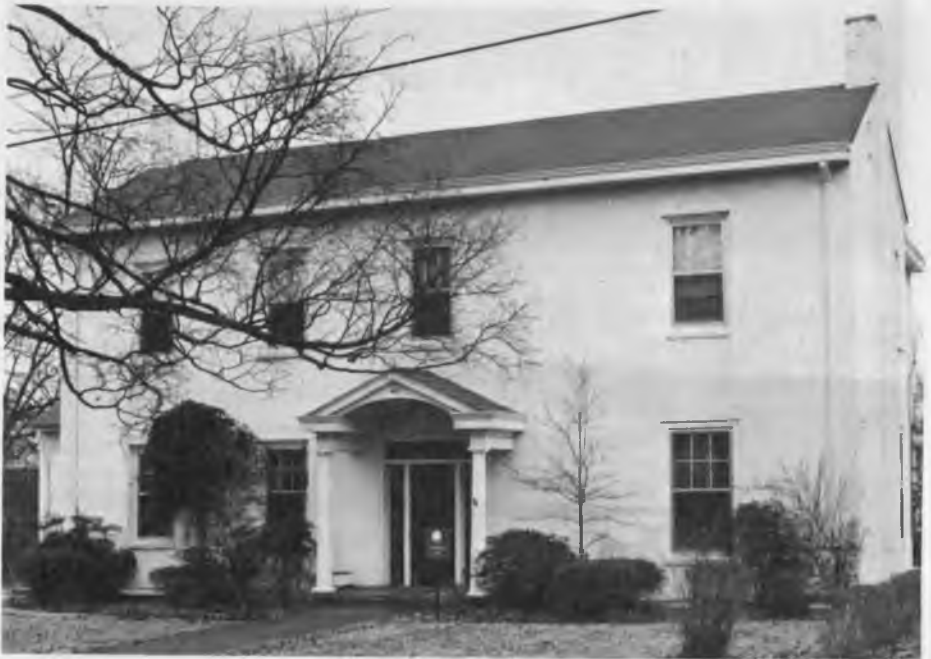
Purdom House, 409 Randolph