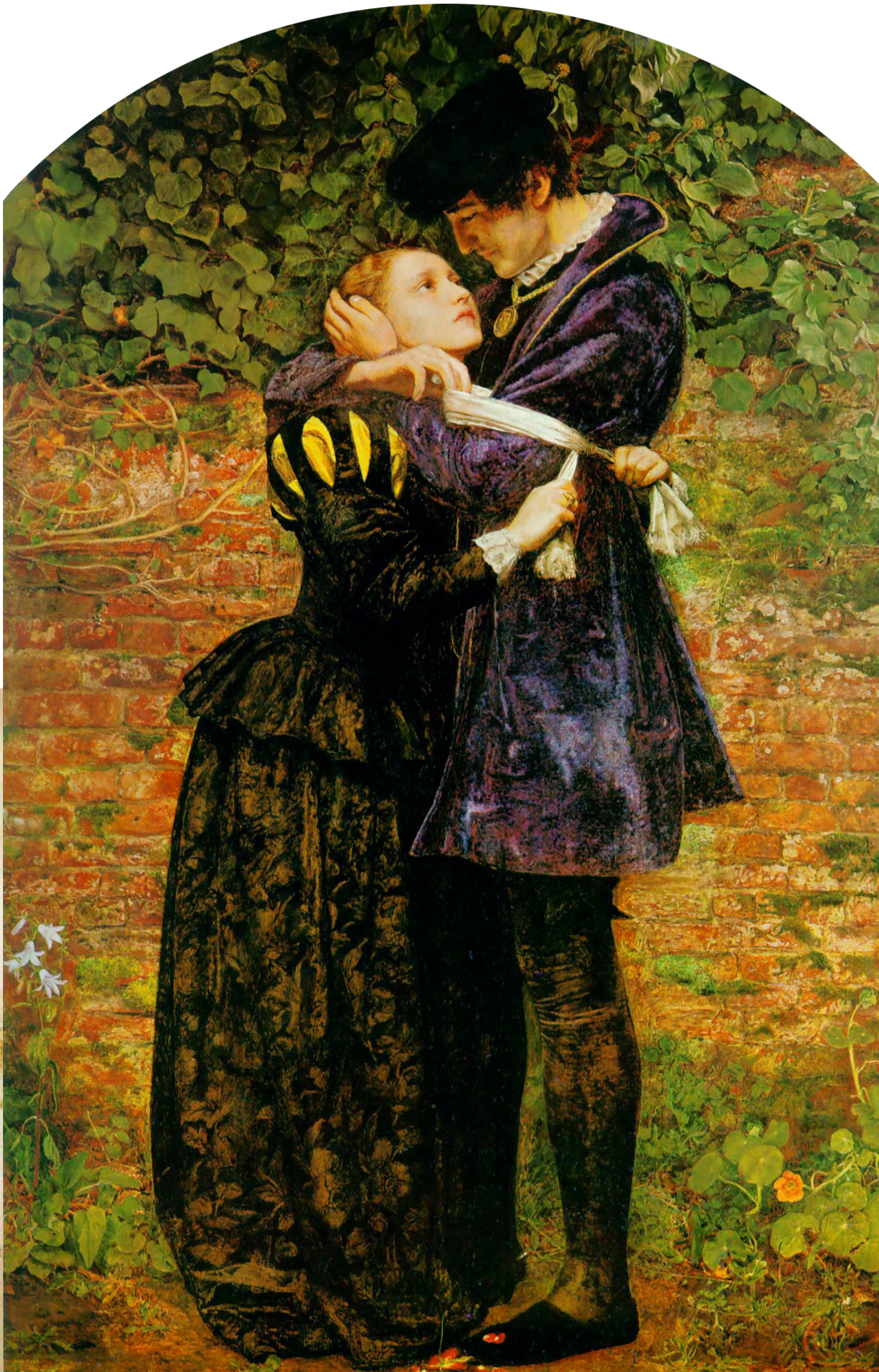
Millais, State of Soul, 1852