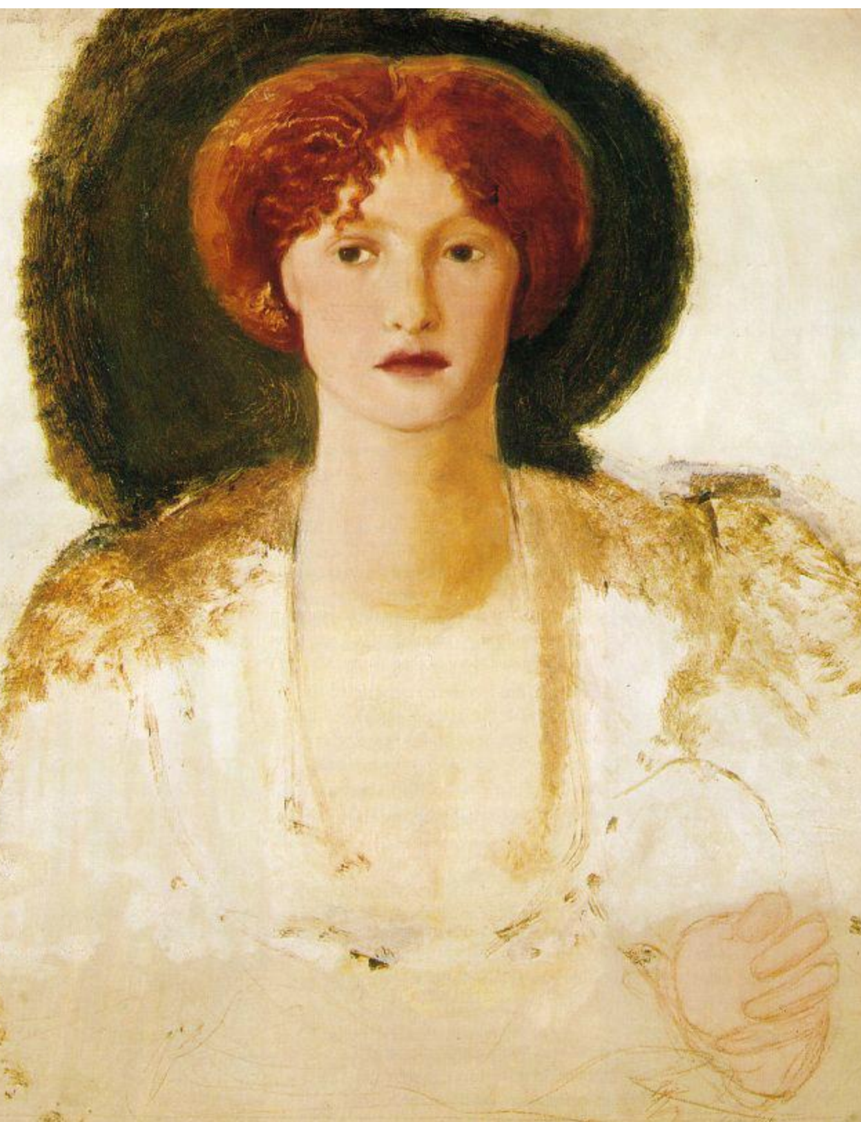
Burne-Jones, Hope, 1862