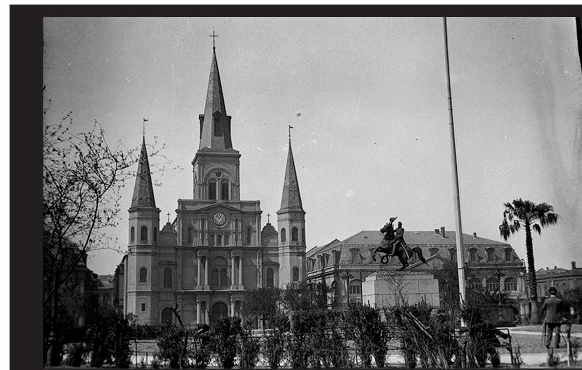
New Orleans, LA