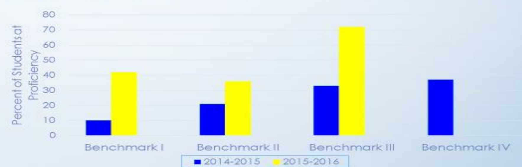
Student Academic Growth from 2014-2015 to 2015-2016 on STAR Reading