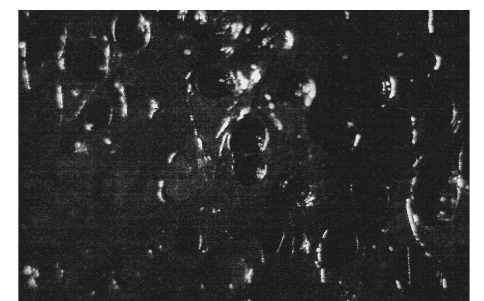
Figure 6 and 7 (Left, Right): Microscopic view (40x) of carbon fiber tape that surrounded the sample