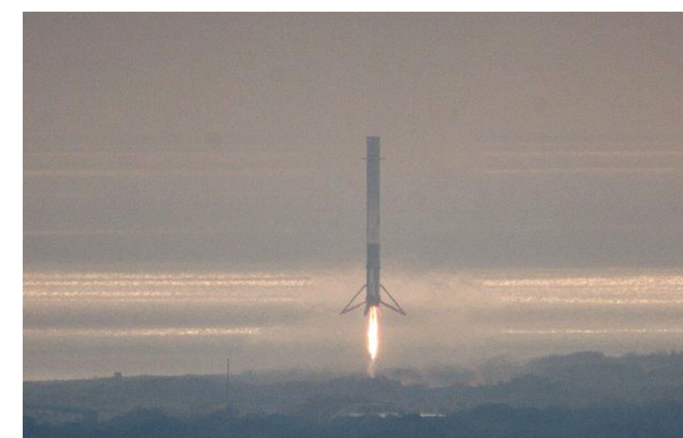
Figure 5 (Left): February 19, 2017 - Mission 9 experiment was delivered to the International Space Station (ISS) via SpaceX CRS-10