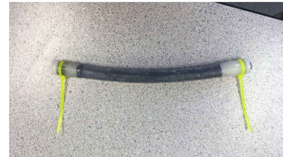
Figure 4 (Left): Sample and double-sided carbon fiber tape secured in Fluid Mixing Enclosure (FME).