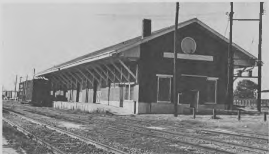
Huntsville Freight Depot