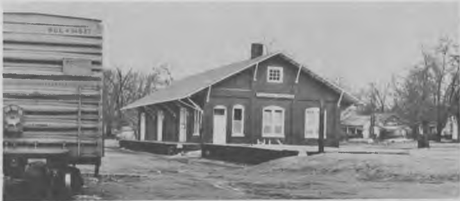
Tuscum-bia Freight Depot

tion, with offices in the second story, and a new freight station" were built at Tuscum-bia. In the 1895 report it was in "good condition."