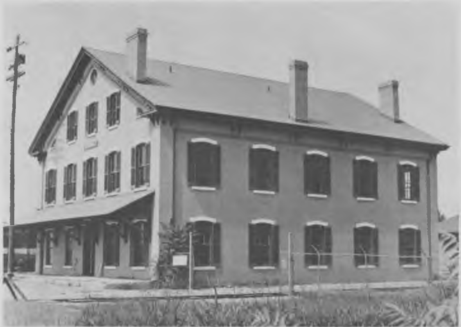
Huntsville Passenger Depot

ley Railroad Company (TVRR). At the time of the sale, the property of the TC&D consisted of the following: