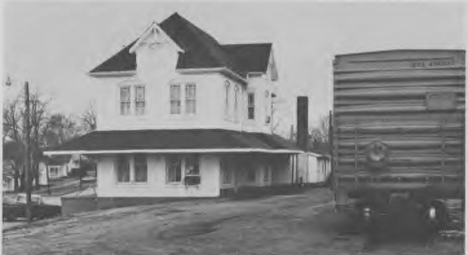
Tusculumbia Passenger Depot

A wooden, combined freight and ticket office depot was built in 1854 and destroyed during the Civil War. A new wooden freight house and ticket office (combined) was built in 1866. In 1889 "a new passenger sta-