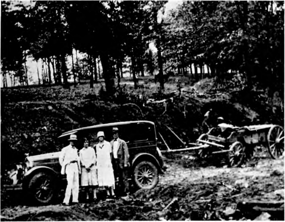
Automobile travel presented a mixed blessing in the early days.

time plantations we have small farms on every hand on which cozy houses have been erected, beautiful churches established and attractive, up-to-date school houses located.