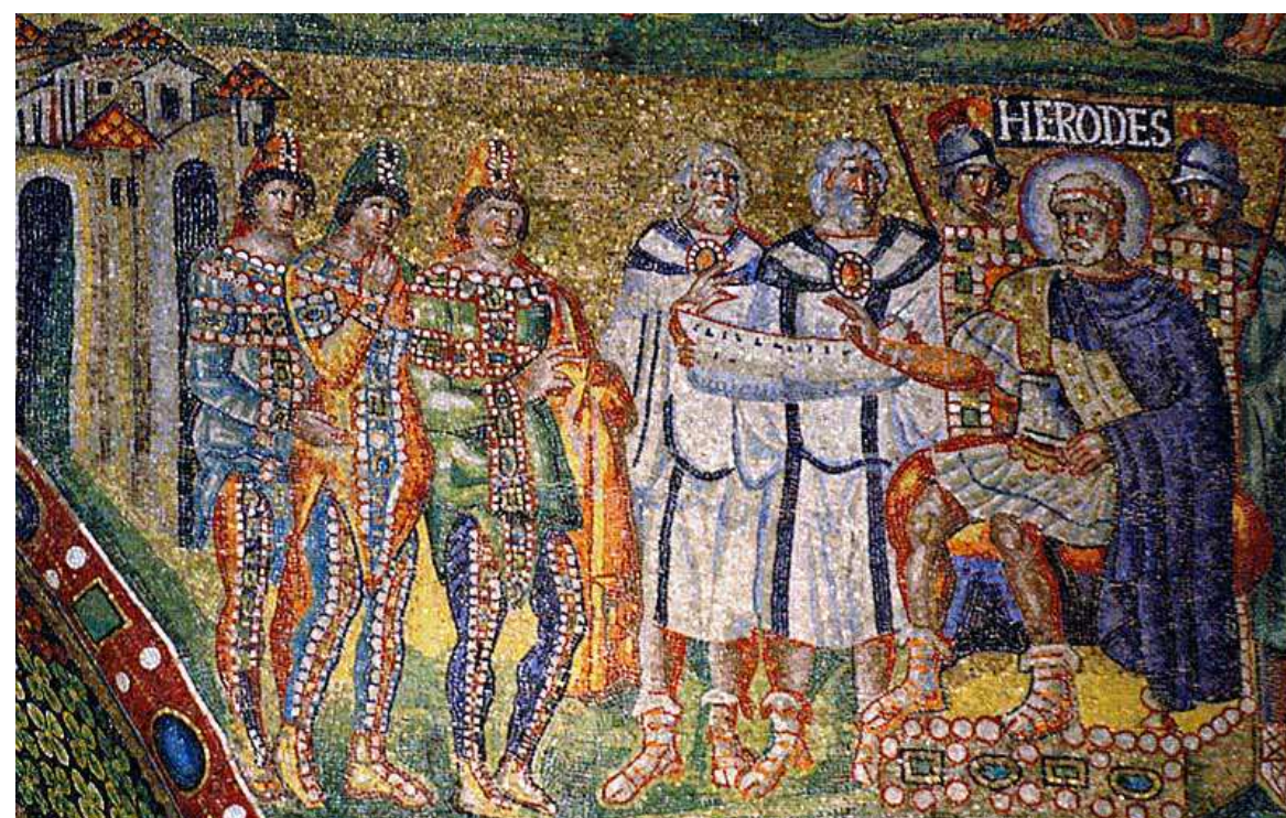
Triumphal Arch Mosaics, Santa Maria Maggiore, Rome, c. 432-440 CE