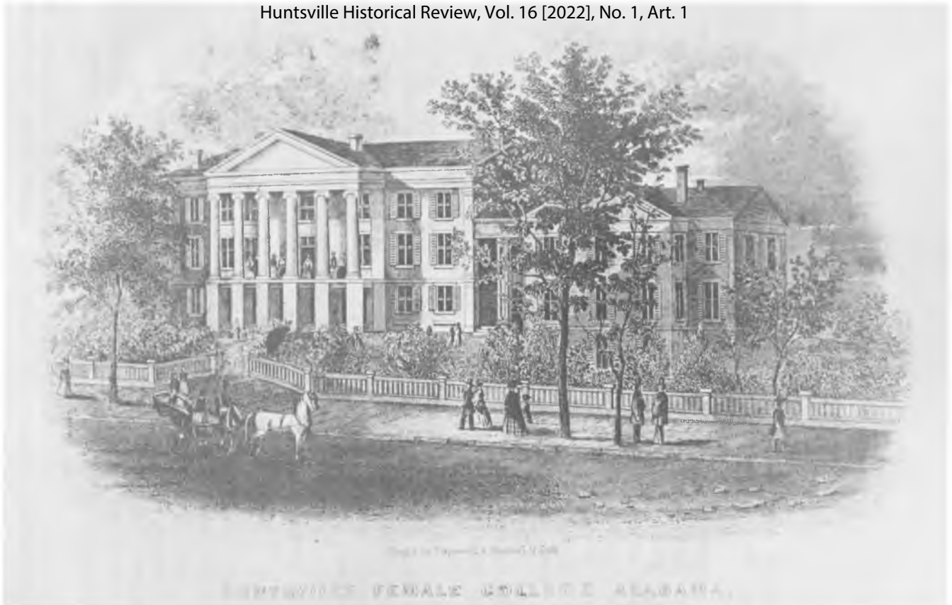
HUNTSVILLE FEMALE COLLEGE ALABAMA.