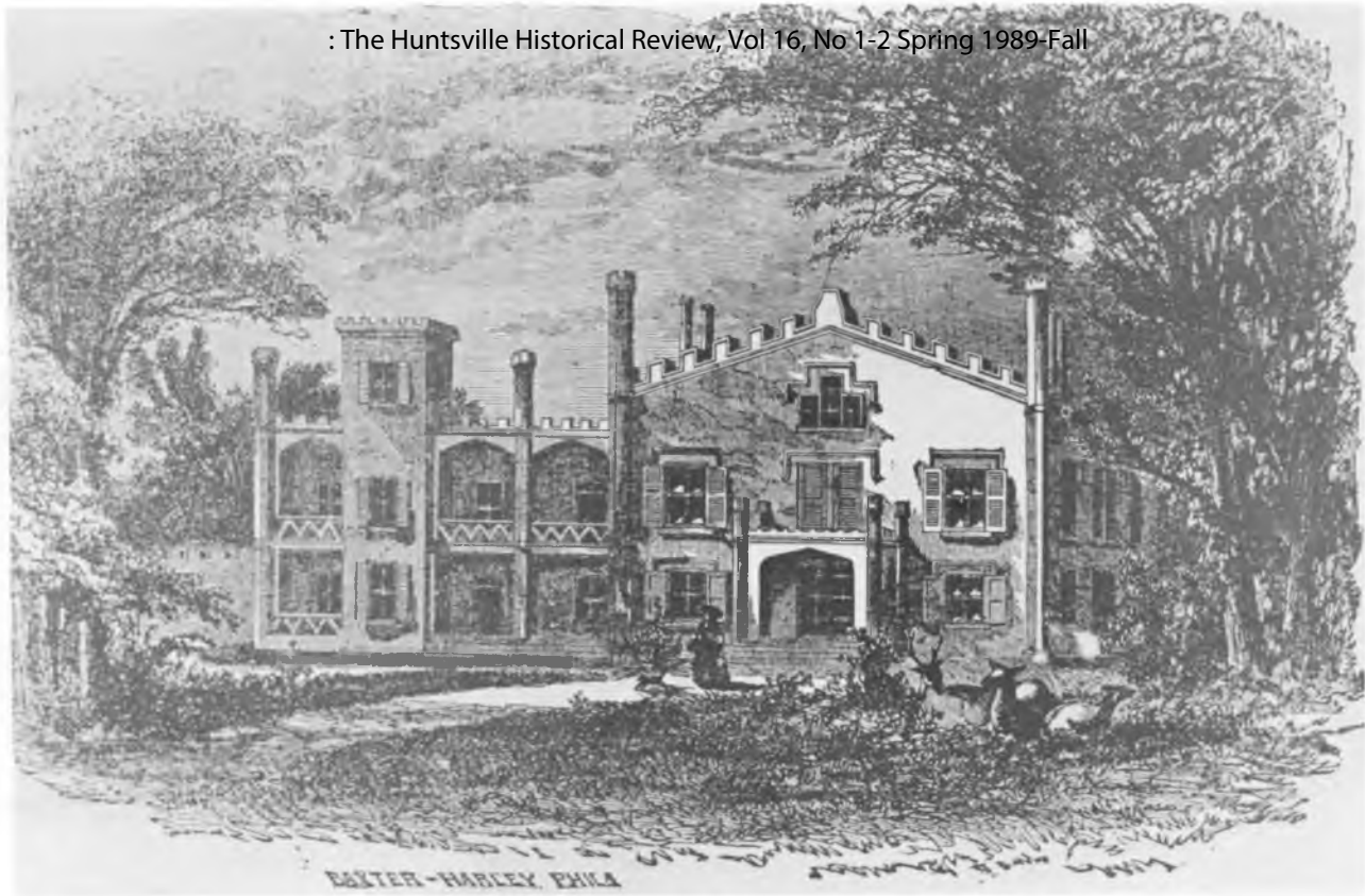
Huntsville Female Seminary, closed as a school when Huntsville was occupied, was later used as a hospital.