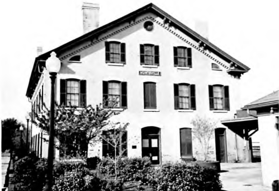
Huntsville Depot and Headquarters for Eastern Division, Memphis & Charleston Railroad, now Huntsville Depot Museum