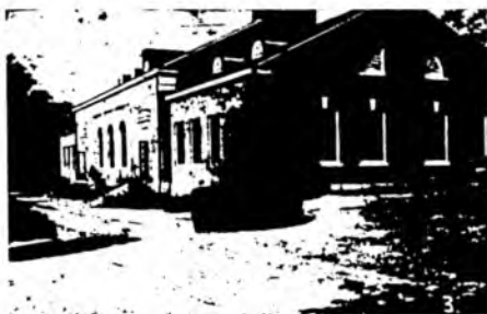
J. F. Drake Hall