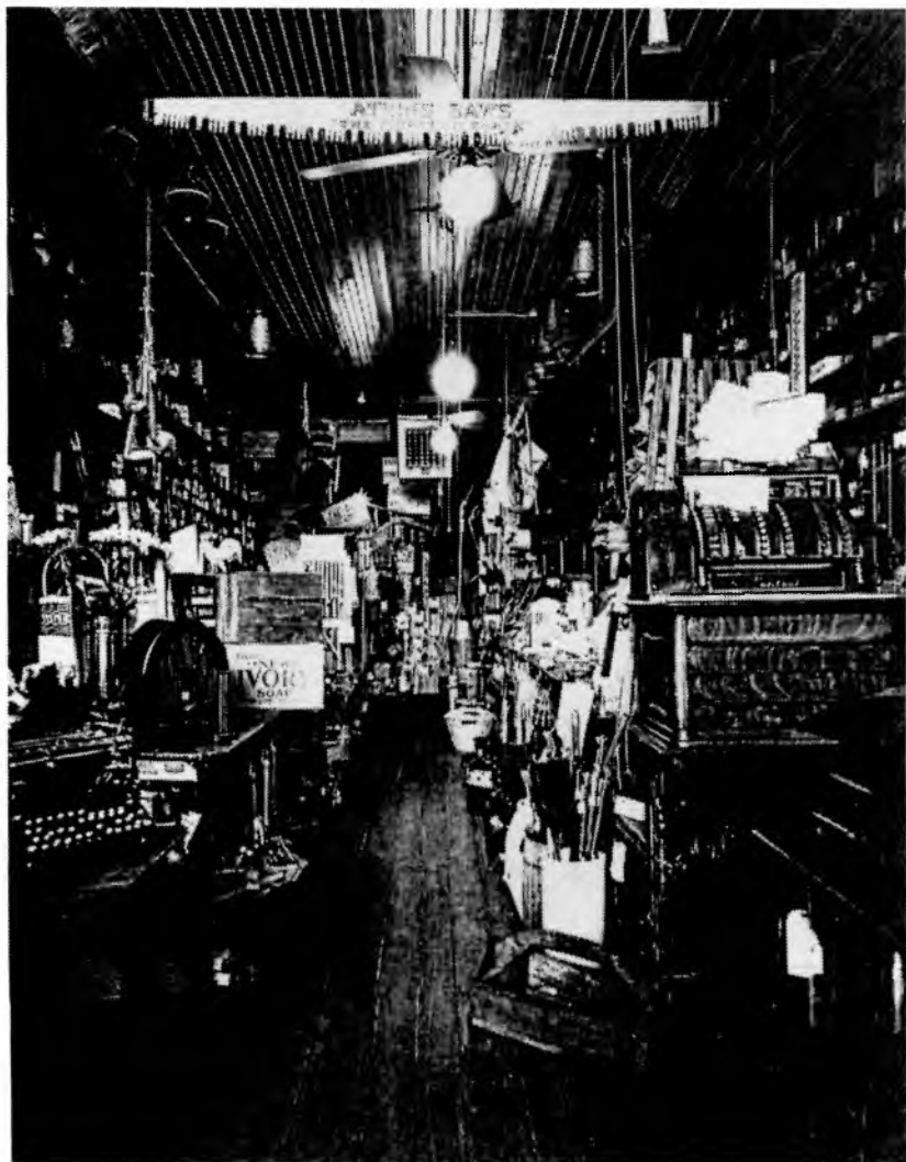
featured in America Restored and Historic America. (see Advertisements, page 177).