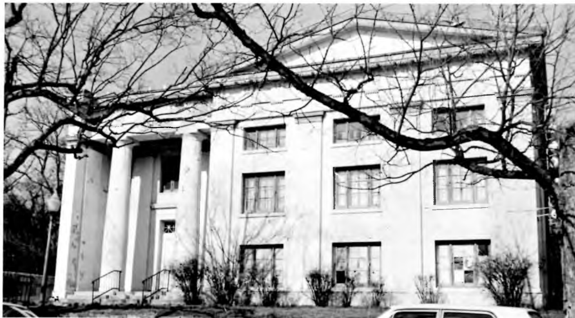
Helion Lodge #1 on the corner of Lincoln and Williams