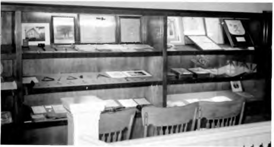
Exhibits depicting the history of the Lodge