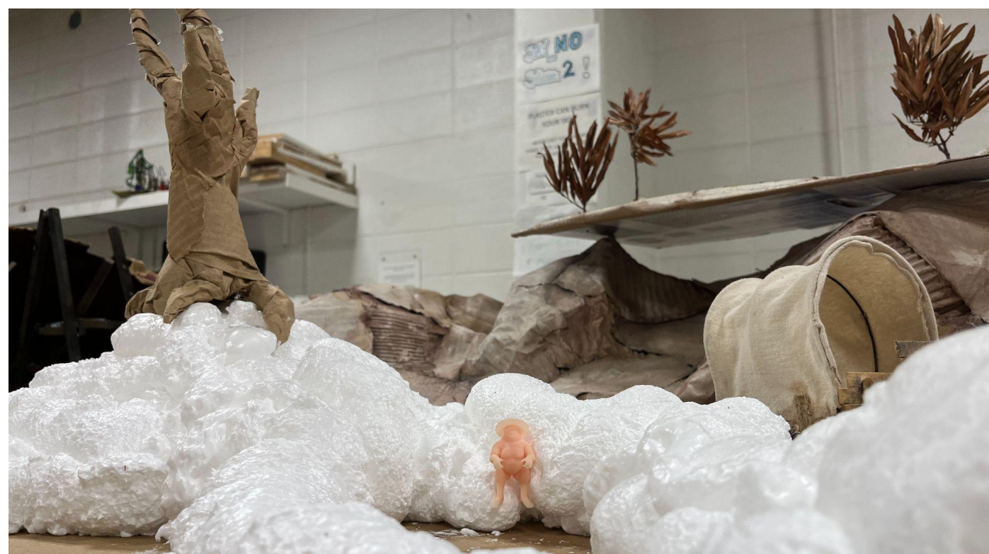
Environments created with cardboard, spray foam insulation, and acrylic paint