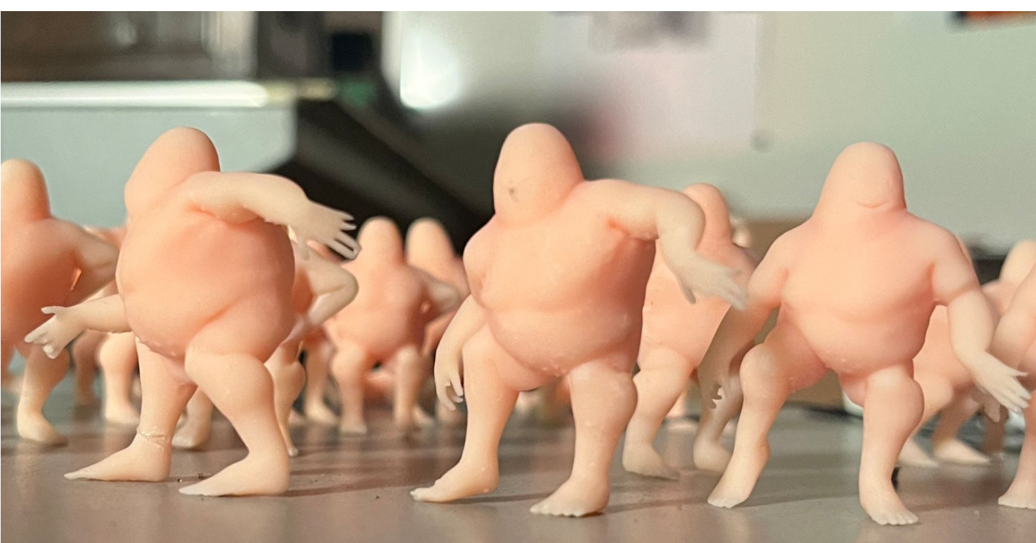
Character swapped out & carefully positioned for each frame to facilitate animation