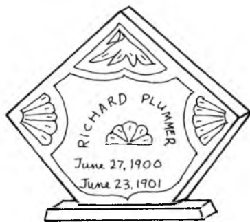
Sketch of the headstones in the Plummer Plot at Maple Hill Cemetery