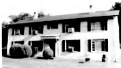
1122 Wellman — Apartments provided landlords with suburban income. The German Bauhaus influence can be seen on this 1930s building in the large casement windows, simple box shape, and smooth exterior. The shutters and slope to the entry overhang are probably later additions.

Mid-century housing for the masses tended toward simple and plain designs based on the Cape Cod house and was constructed of wood. By the 1950s Huntsville experienced tremendous growth, and houses were built wherever there were vacant lots. These houses of the 50s and 60s illustrate the popularity of the ranch style. In a neighborhood of forty feet wide lots, these long low brick homes required a minimum of two lots to stretch across. Even today, new houses appear or older homes are remodeled in a neo-style that freely mixes historic and modern elements and materials to create new designs.