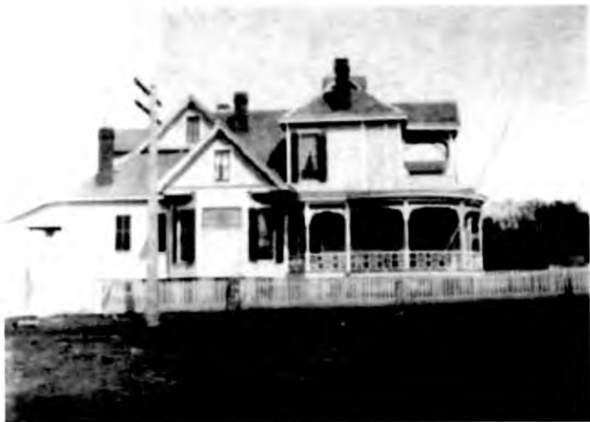
Vaught-Huff-Nicholson home, 1911—700 Ward Avenue (now 701) was built in 1900. This view illustrates the more Victorian elements of the wood frame home such as the porch frieze of spindles and brackets and a baulastrade of spindle work rectangles of Eastlake ornament. Note the electric pole and unpaved road. Courtesy H/MCPL.

other's talents. This being before the days of artificial entertainment, we created our own and took joy in it" (Fisk & Pinkerton).