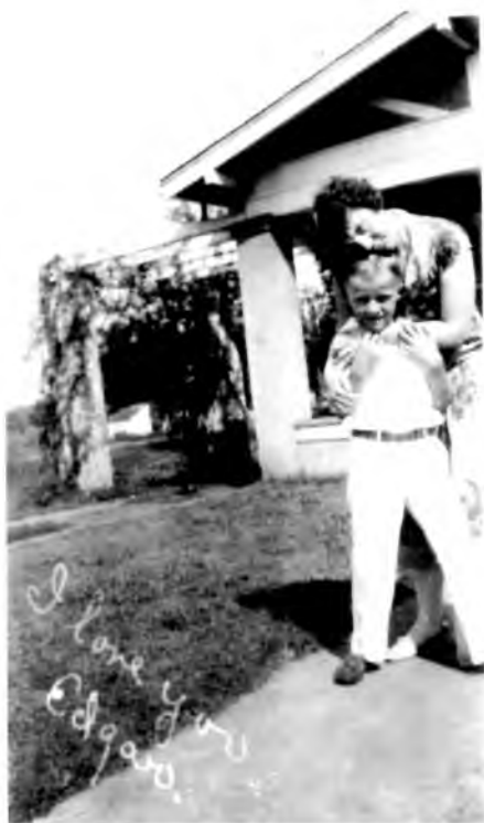
903 Pratt, mid-1920s —Notice the bungalow roofline, the under-eave brackets, and the vine-covered trellis porte-cochere. This photo also illustrates the light density of Five Points development at this time.