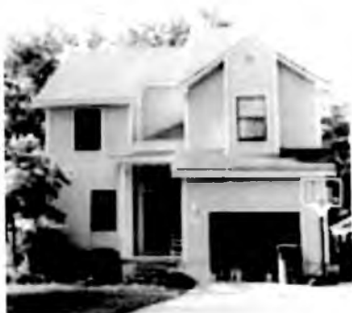
1315 Ward Ave. — Modern infill housing combines some historic elements and a general massing of the district.