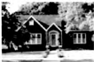
1205 Clinton — A brick home of Cape Cod massing but detailed around the door and chimney with English Cottage stone work and a slight Tudor influence on the peaks.

entire 20 th century stylistic range as infill development occurred.