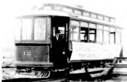
Trolley Car—The convenience of the trolley made it possible for workers to live farther from their place of employment, and the sides of cars provided advertising space.