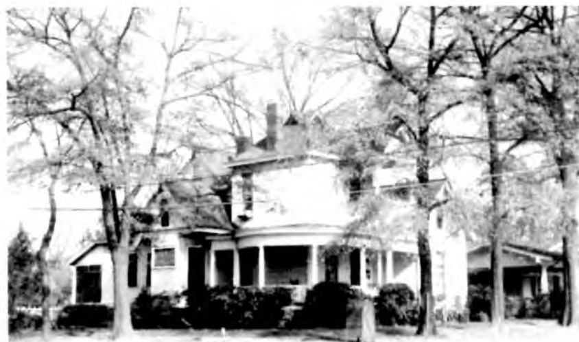
700 Ward Avenue, 1962—The ornament of the porch has been replaced by columns, a solid frieze, and a railing of rectangular baulusters. The brick foundation piers have been filled in, and the spindlework of the upper floor balcony is gone. The changes reflect a Colonial Revival style. However, the pediments contain flat decorations that, along with the massing and irregular planes of roof, suggest the late Victorian original.