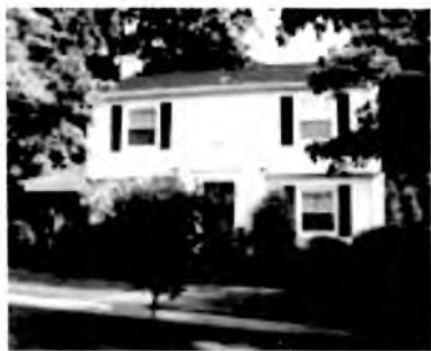
1018 Ward Ave. — The Toney-Uptain home is a two-story Colonial style that was built in 1941. This was the start of adaptations of many historical styles to incorporate modern use. Homes also no longer needed to respond to climate, thus a New England type Colonial in the South.