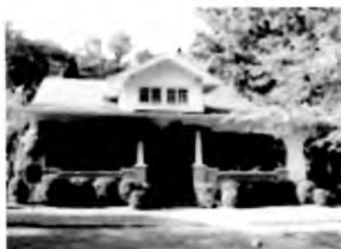
1115 Ward Ave. — The Livingston home was built in 1929. The bungalow elements include large overhangs, a front dormer, a deep front porch, and a porte-cochere.

The Five Points District began as the East Huntsville Addition and grew slowly over the course of a century. For this reason it illustrates the change in style and building type for both commercial and residential structures. Neighborhood housing began with types popular at the turn of the 19 th century and spanned the