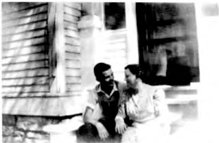
Home —Mother and son sitting on the back porch steps.

of a home. Series of photographs of families and their homes show the changes to the structure that paralleled changes in the family situation—sometimes more clearly than the owners and neighbors wished.