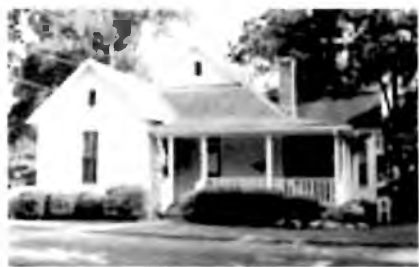
808 Ward Ave. — Simple Victorian wood-frame homes retain the varied massing and L-shapes of more elaborate Victorians. The exterior details are simpler and restricted to the use of shingles or siding. This updated version is aluminum sided.