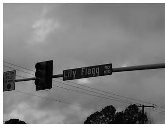
Lily Flagg Road