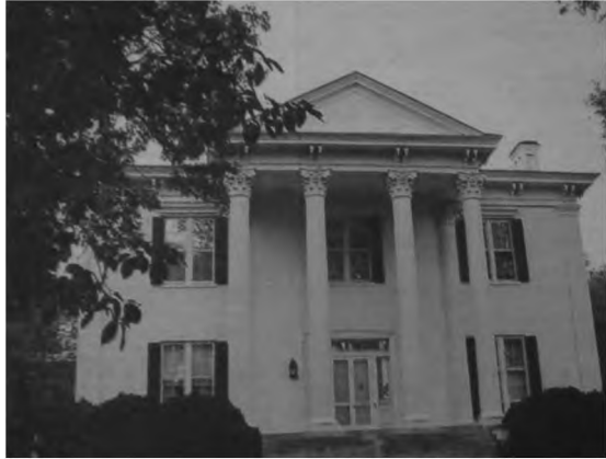
603 Adams Street, The Moore Home