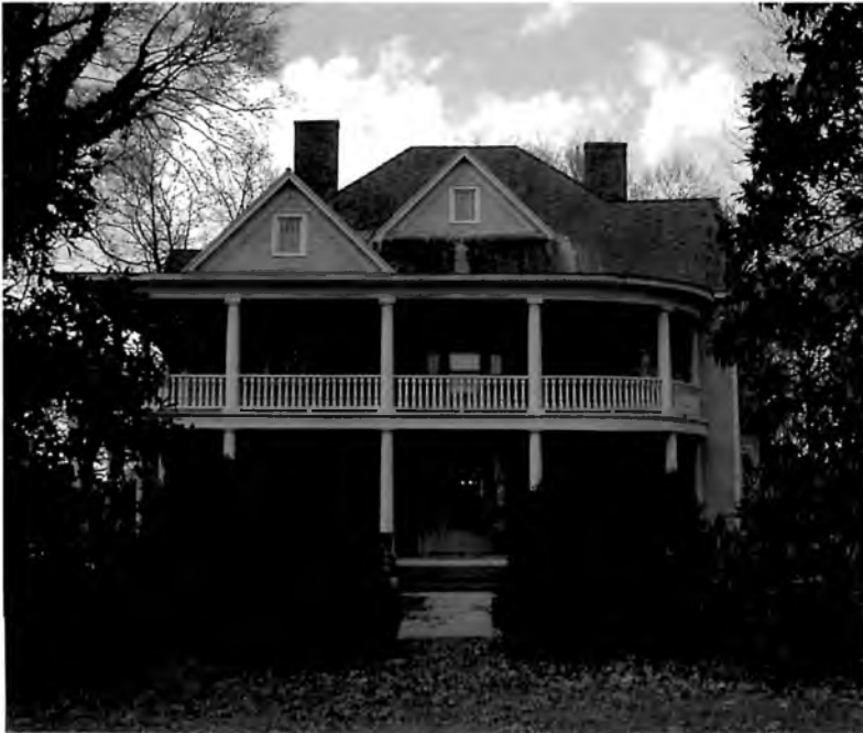
19 Front Street, ca. 1895 and 1904

tour of homes. The society is currently participating in the city's Downtown Redevelopment Committee. Madison has contracted with Auburn University's Center for Architecture and Urban Studies to develop a master plan to reinvigorate the downtown area. The society's participation will help to ensure that new development will enhance and complement the historic character of the district and not endanger any of the historic structures.