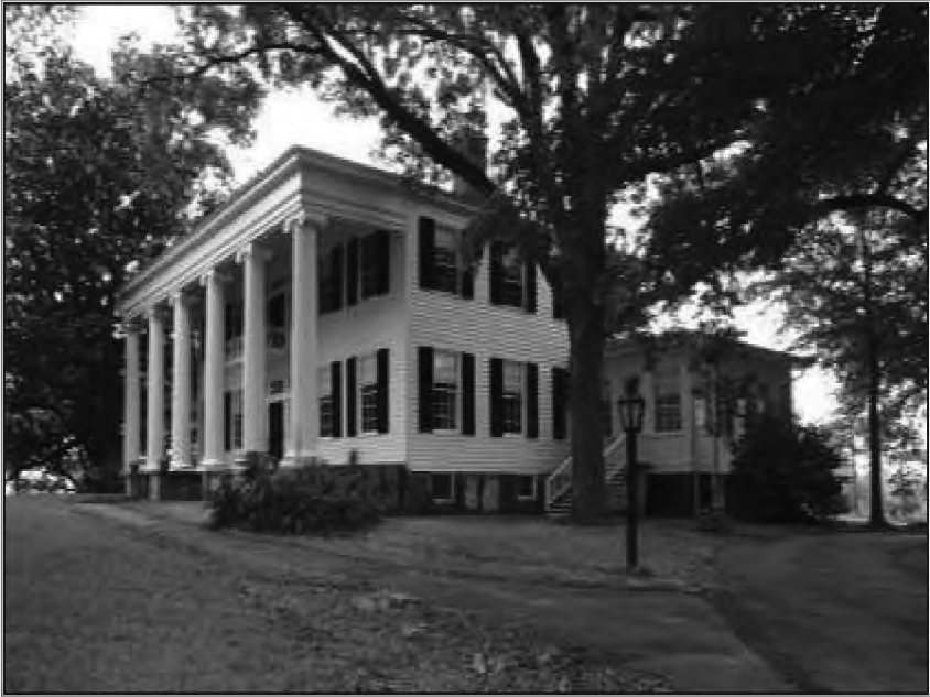
Thornhill House (HABS)