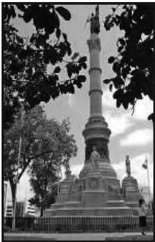
Montgomery Confederate Monument