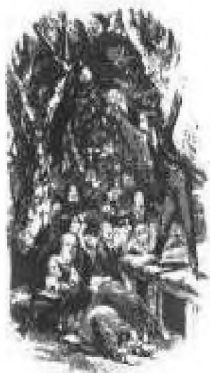
1819 Methodist camp meeting

Moreover, the Second Great Awakening was upon the land. A renewal of camp meetings flourished at Blue Springs and Jordan's Camp Ground, for example, and pointed people into wholesome directions. These religious meetings, with all their drama, were often led by an untrained preacher. He maintained nonstop preaching in daylong meetings that lasted far into the night, accompanied by singing, prayers, sermons and a fervent religious spirit. Preaching