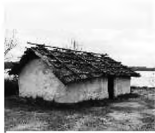
Early Cherokee House

In about 1765, some of the Chickasaws from the western portion of the Valley moved into an area near the Tennessee River in what is now the southern part of Huntsville. This was challenged by the Cherokees, and in 1769, there was a major battle at the settlement; the Chickasaws won, but