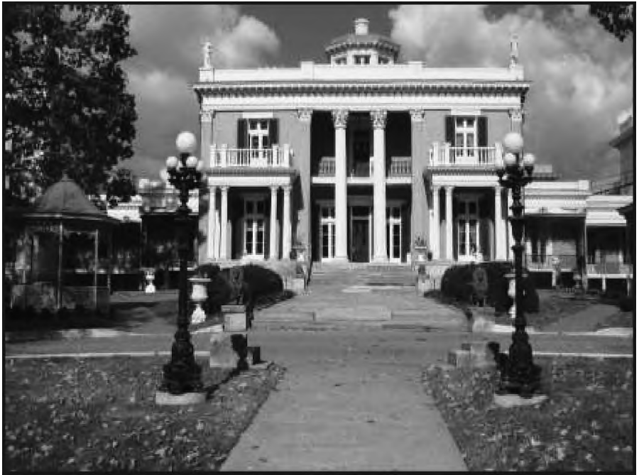
Belmont Mansion (HABS)