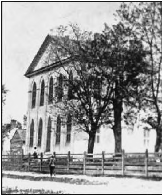
Masonic Lodge, Huntsville