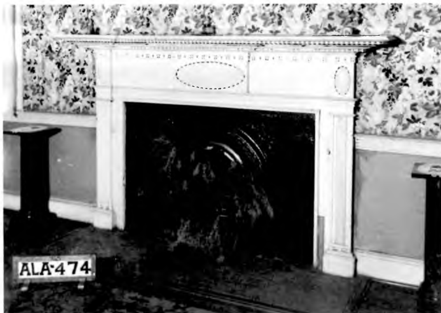
Federal mantel in northwest room.

property for $5,200 at auction in 1868 but did not receive title until the purchase price was paid in full in 1877. The lot now fronted about 84 feet on Eustis Avenue and extended to Gates Avenue on the south, and it remained in Burritt family ownership for over 70 years. 4