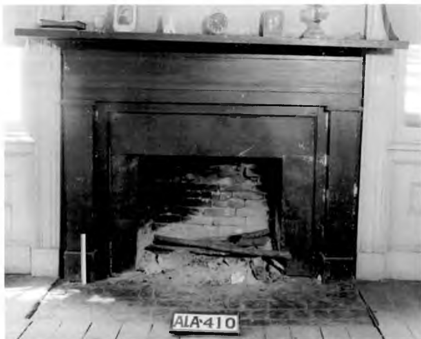
The only interior shots of the Horton house are of two fireplaces, neither of which had been altered to burn coal as were so many in the late 19th century when it became commercially available.

and six children in a state of uncertainty, which lingered into the war years. Rodah had amassed not only extensive land holdings in Madison County but also a major plantation in Marengo County containing 1,361 acres that was managed by an overseer. The Marengo County estate inventory listed 115 slaves, 9,000 bushels of corn, 8,000 pounds of cotton, 2 cotton gins, and assorted mules, horses, oxen, cattle, and 230 hogs. The real estate inventory for Madison County included the homestead of 96 acres, 320 acres at the “old residence,” 280 acres north of the old residence, an additional 1,625 acres in several tracts in various locations, and two houses and lots in Huntsville proper. He also left 63 more slaves (many of whom were children), an additional 14,000 pounds of baled cotton, and 450 barrels of corn. 5