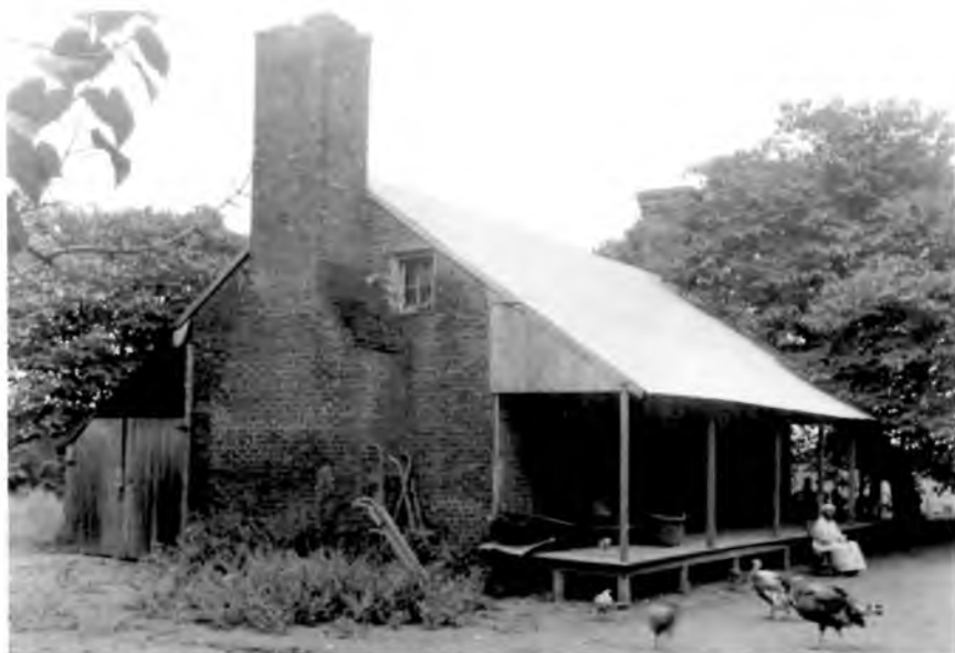
This two-room, brick structure behind the house reputedly was the original kitchen and dining room.

she directed that her two remaining properties be sold for payment of her debts and the “remainder used for putting monuments over my grave.” Ironically, the Wade cemetery, located beyond the house, has no stones so it is impossible to know who was buried there and whether her wishes were ever carried out—the one request she could not control. 2