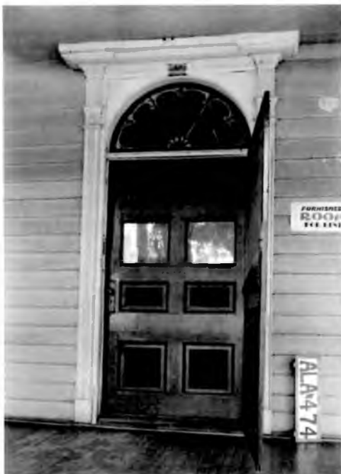
Detail of the Federal doorway with fanlight. The sign advertises, "Furnished Room For Rent." Photograph by Alex Bush for HABS, 1935

Probate court records of the Read estate track the home during the Civil War and the ensuing lean years. An 1863 policy from the Lynchburg Hose & Fire Insurance Company protected the house "against loss or damage by fire to the amount of $4,000 for one year, viz $2,500 on the two-story building...$1,500 on the two-story