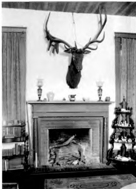
The fireplace mantels are of Greek Revival derivation, but they lack the boldness and scale that characterize the house. Naturally, only the mantels in the formal rooms would have been photographed, so those upstairs or in rear rooms may have been more influenced by Federal tastes. This mantel retains the traditional black finish. The wooden ceiling is unpainted. Nothing is known of the deer's history.