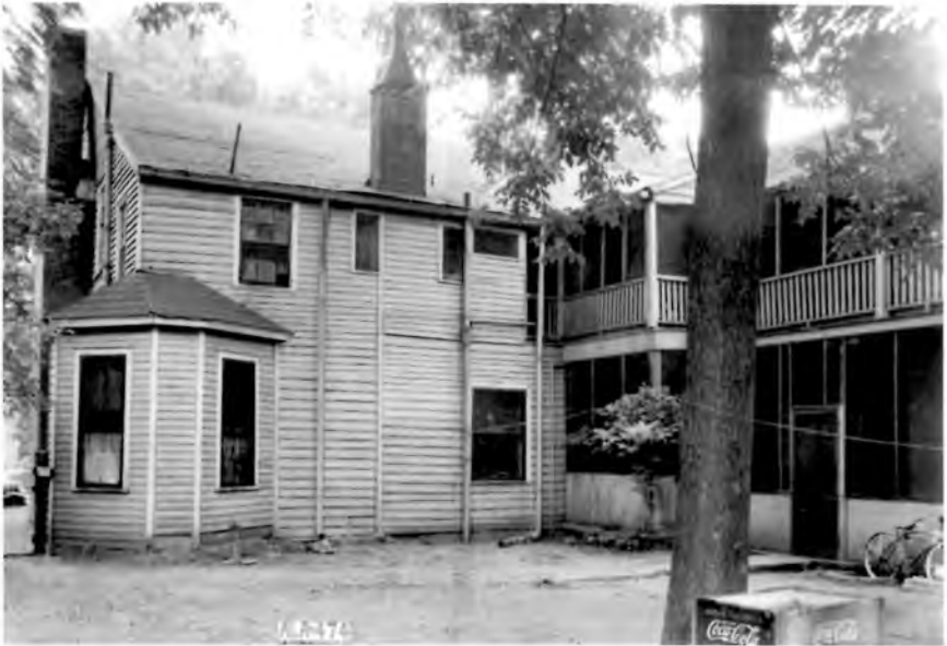
A rear view of the house in 1935 showing part of the brick addition.