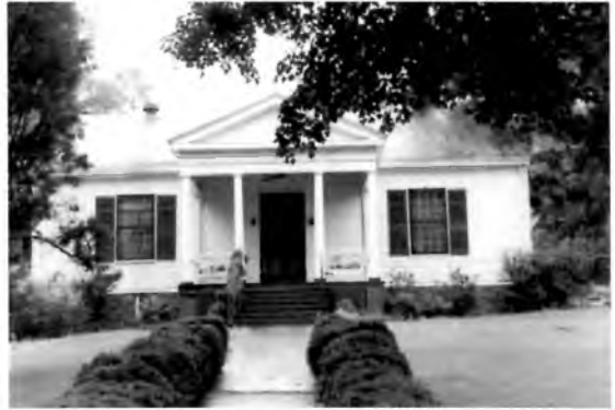
The Chapman-Johnson house on Dairy Lane.

Researchers investigating the past are no strangers to speculation and guesswork and are used to revising interpretations or changing conclusions when new information comes to light. An archaeologist's understanding of the past, for example, may be altered by the discovery of inscriptions on an ancient tablet. Or new clues can emerge to challenge assumptions made in the course of historic preservation research. Sometimes information turns up that simply confounds rather than clarifies. It is just such a case that leads us to take another look at a property