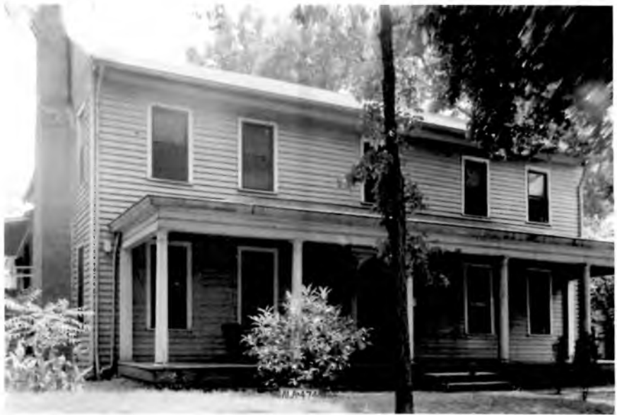
After its 1908-1913 conversion to a boarding house, the dwelling gained a new porch that extended the width of the façade.