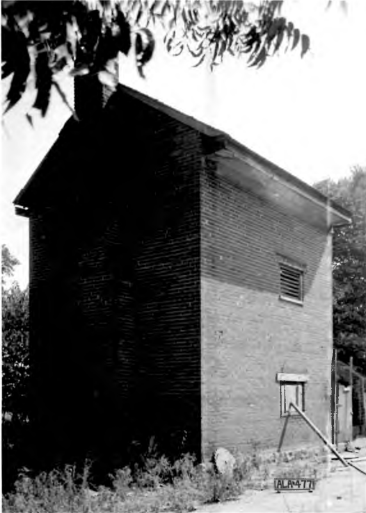
Built to the same massive scale as the house, the smokehouse still stands today in excellent condition. A huge fireplace on the ground floor produced smoke to preserve the meat, which was hung from rafters on the upper level. The small, louvered side vents now have glass installed behind them. Photograph by Alex Bush for HABS, 1935