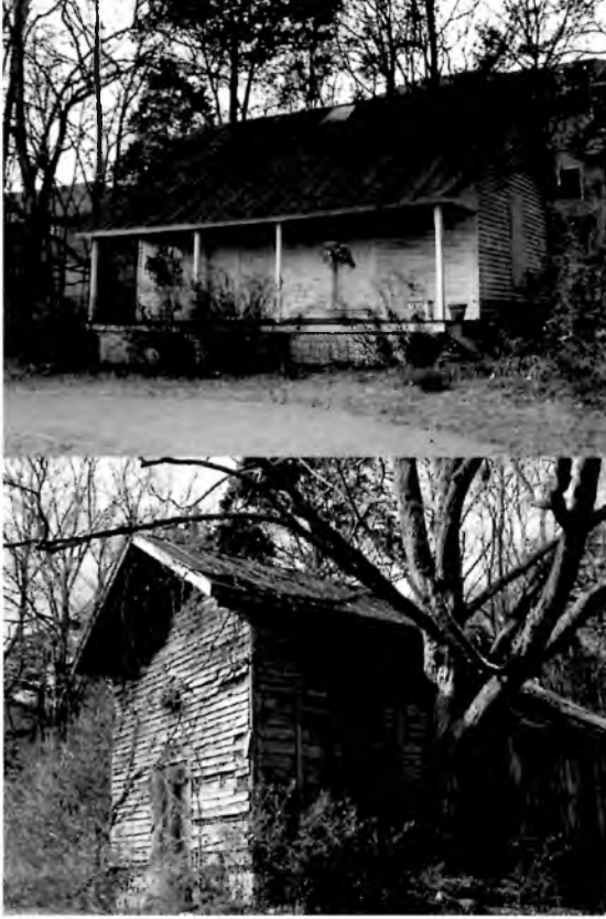
Above: The 1870s office/boys' quarters/servant quarters?