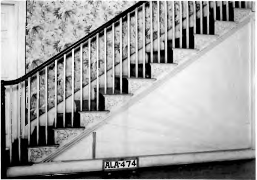
Fan detail on staircase.