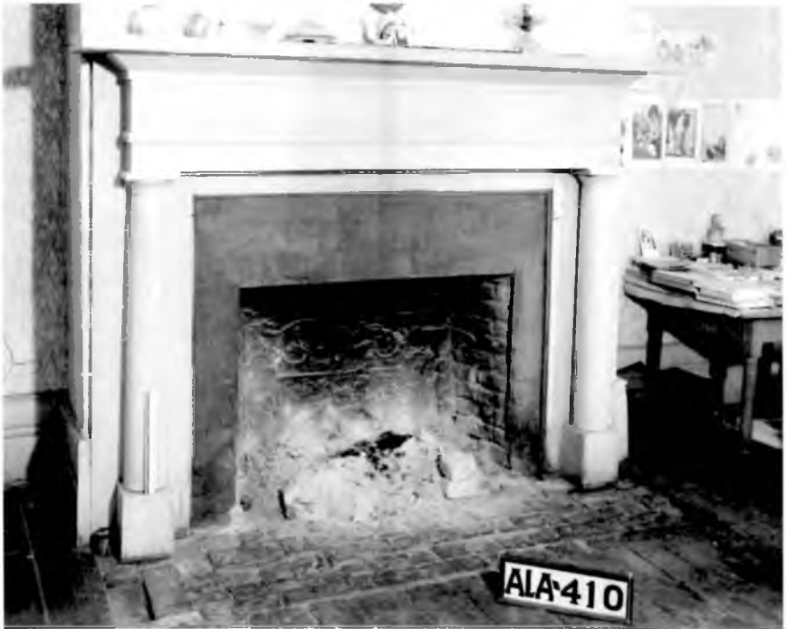
This fireplace protruded into the room and was more ornate, having an engaged column on either side. Faintly visible on the back wall of the firebox are bits of the design left by a cast iron fireback that was installed to help reflect heat into the room and protect the masonry of the chimney base.